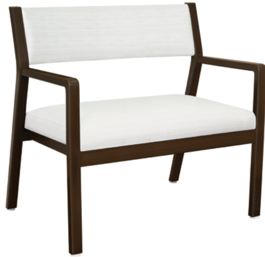
Model: CTEB21 34W 24.5D 33.75H 30.5SW 19SD 19SH 25AH

The Caterina Bariatric Guest Upholstered Back chair is a perfect marriage of aesthetics and durability. Built for maximum stability and strength with the addition of solid steel in all joints, this thoughtfully designed chair accommodates generous proportions. Available as a slat back and a short upholstered back, it features a spacious removable seat, an angled back and contemporary arms to facilitate ingress and egress.